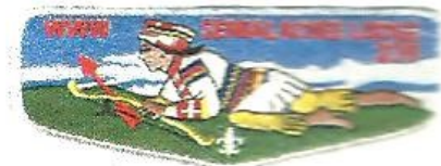
Semialachee Lodge 239