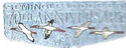
Seminole Lodge 85