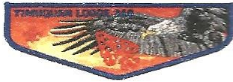
Host Lodge- Timuquan 340