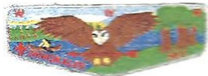
Immokalee Lodge 353