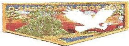
O-Shot-Caw Lodge 265