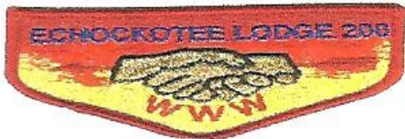
Echocotee Lodge 200