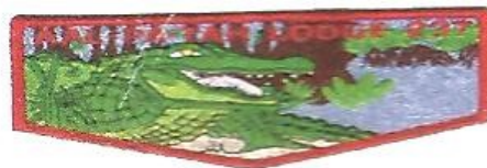
Aal-Pa-Tah Lodge 237