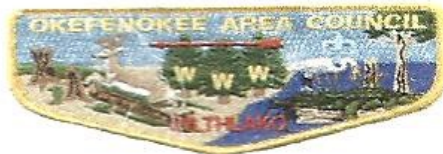
Pilthlako Lodge 229