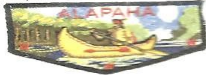
Alapaha Lodge 545