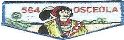
Osceola Lodge 564