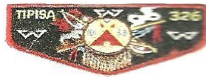
Tipisa Lodge 326