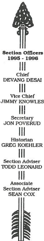
Jimmy Knowles SR-4 Section Vice-Chief